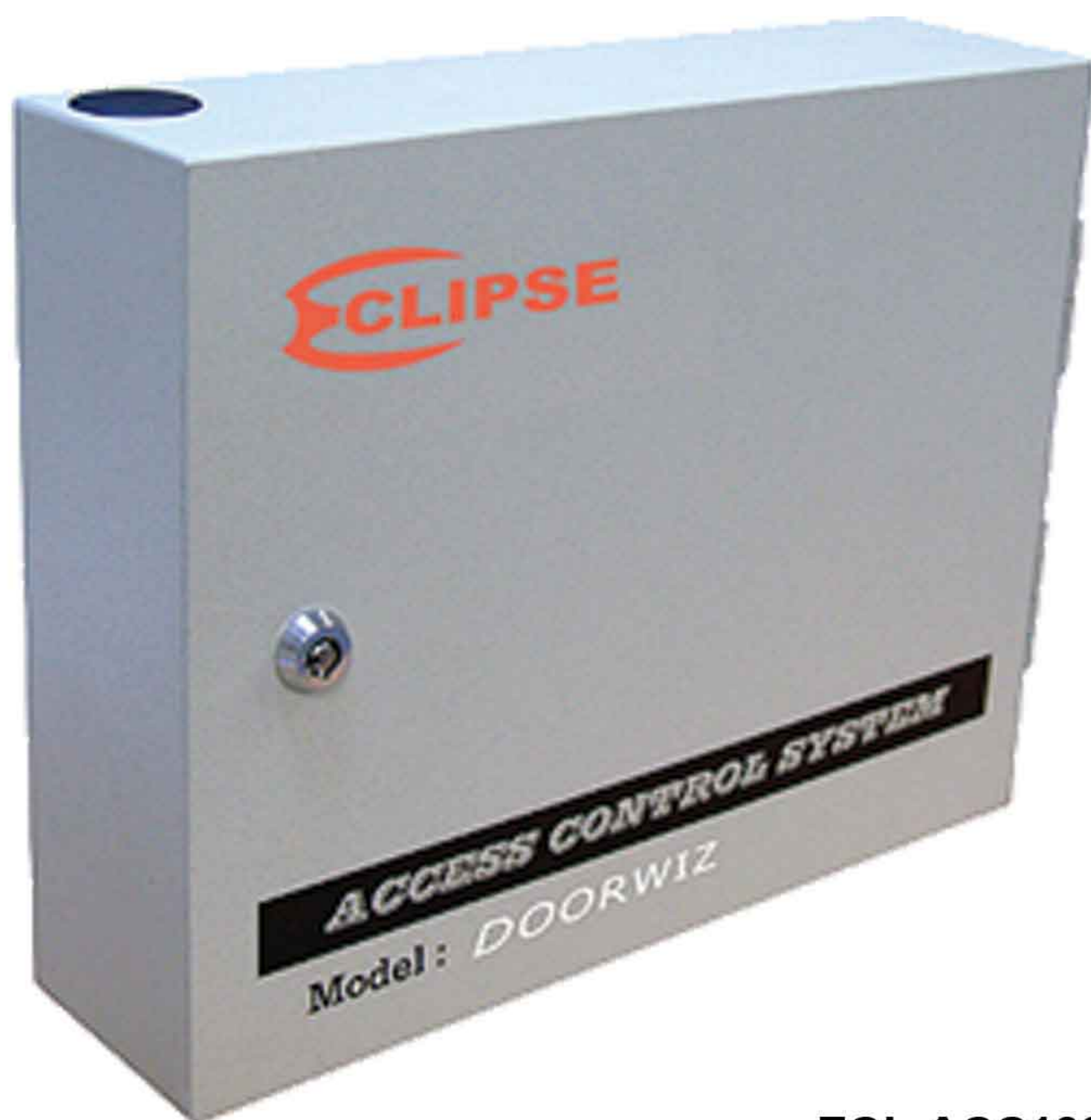
ECL-ACC1010 I/O Expansion 8 DI & 8 DO Board Ethernet Interface 10 Base-T (Optional)